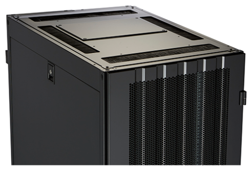
Four-way brush entry roof panel