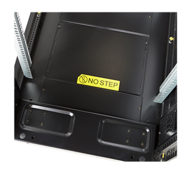
Sliding airfill plates