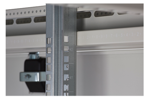
U height profile markings