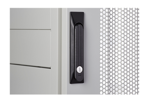
2-point lock wave vented front door