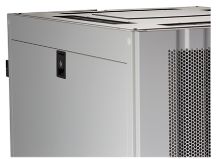
Quick-slam latch side panels