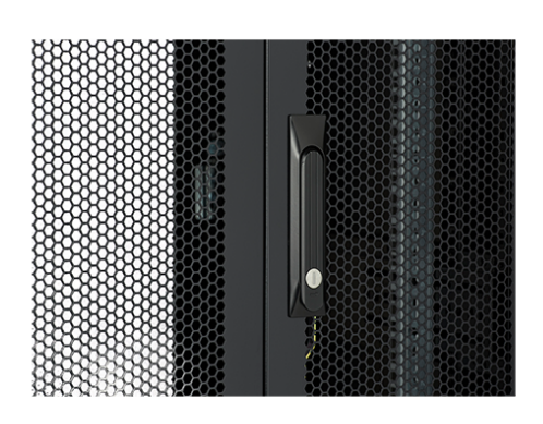
3-point wardrobe vented rear doors